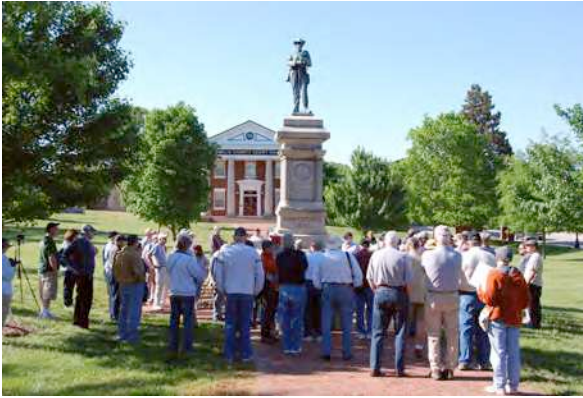
At Amelia Court House