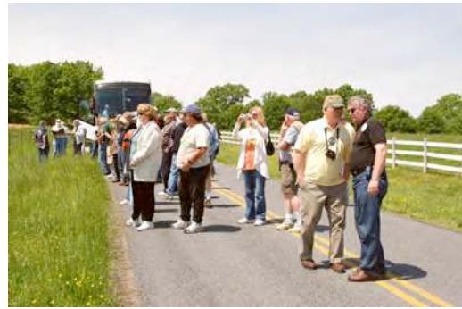
On the road again...