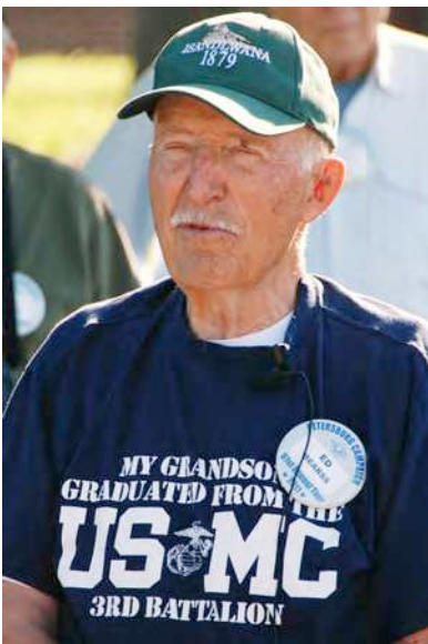
Ed Bearss