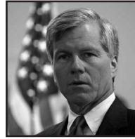
Gov. McDonnell of Virginia

easements that protect the lands from future development.