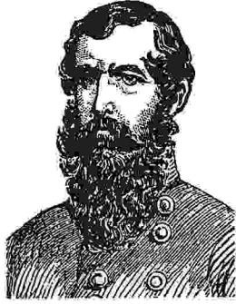
General John Pemberton