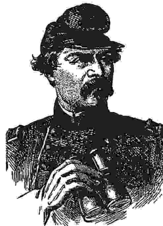
General George B. McClellan