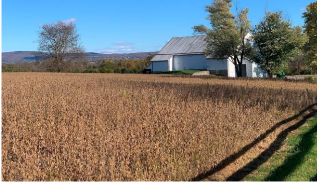
Mumma Farm, Antietam

Crucially, the fall harvest was at hand: the movements and fighting over the battlefield destroyed crops – corn, potatoes, apples and other fruits. After the battle, with a 75,000 strong army camped in the area and beset with supply problems no farmstead’s crops were safe. And despite General McClellan’s directive prohibiting it, troops began to loot – cattle, hogs, chickens, hams from